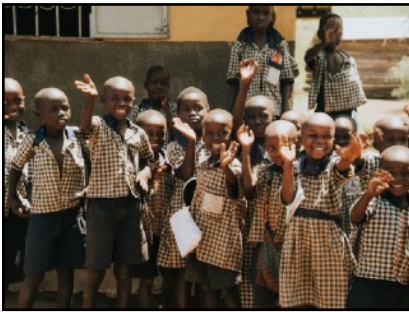
One of our Secondary Students (top photo) and children at K&K (bottom photo)